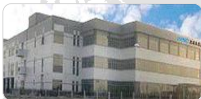
啟碁永昌通訊 (崑山)